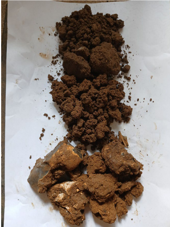
Graphic A-4 3W8535SA Sandy silt loam over sandy clay loam and sandy clay. WC II and Grade 2