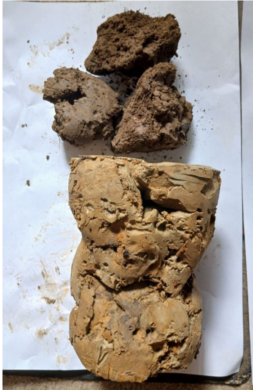
Graphic A-5 3H4511HP Typical Wickham soil, medium clay loam over clay, WC IV and Subgrade 3b