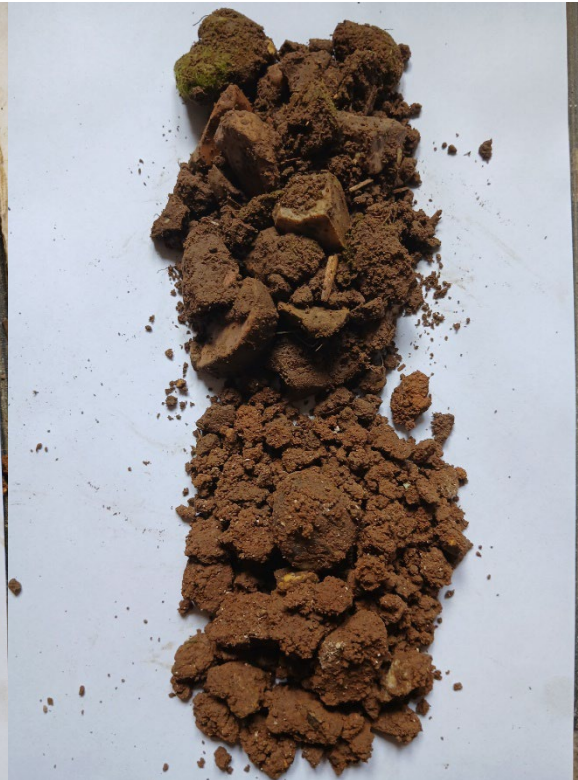
Graphic A-2 3F2521HP Typical Carstens soil. Medium clay loam over heavy clay loam, WC II and Grade 2