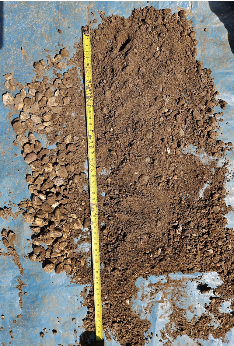
Graphic A-10 TL1