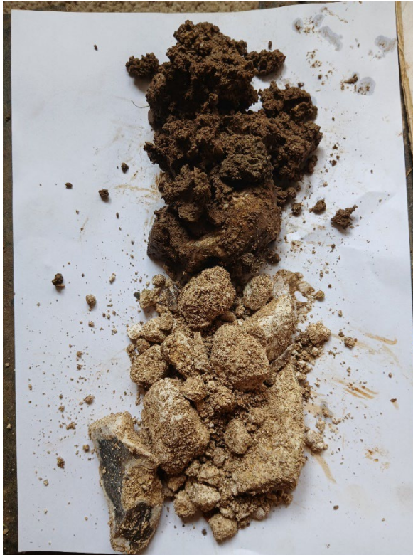
Graphic A-1 3E3113HP Typical Upton 1 soil. Medium clay loam over heavy clay loam and chalk, WC I and Grade 2