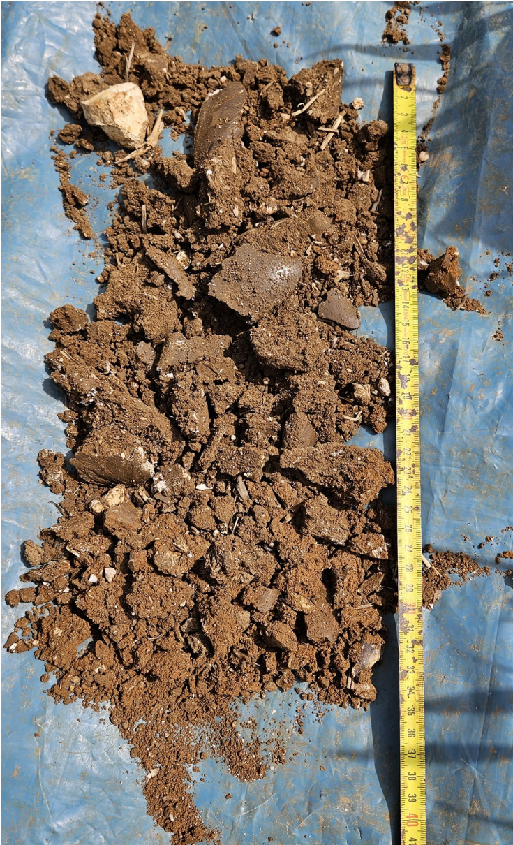
Graphic A 8 SE1